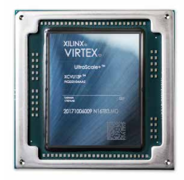
Xilinx VU13P FPGA: lidless package is used by BittWare's Viper thermal management for enhanced cooling performance