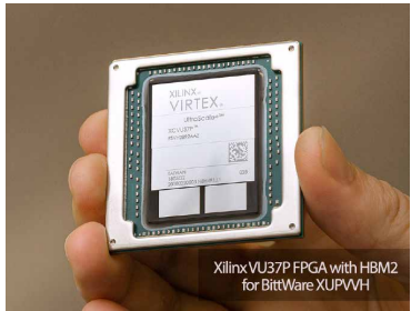
Xilinx VU37P FPGA: lidless package is used by BittWare's Viper thermal management for enhanced cooling performance

BittWare's Viper platform uses advanced computer flow simulation to drive the physical board design in a thermals first approach, including the use of heat pipes, airflow channels, and arranging components to maximize the limited available airflow in a server. Viper boards are passive by default, with active cooling as an option.