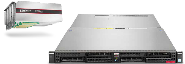
Four Achronix Speedster7t, Intel Stratix 10 or Xilinx UltraScale+ FPGA cards